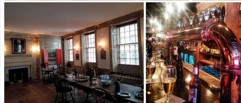
Then we lunched at Frances Tavern.

The Oculus at the World Trade Center PATH station is a beautiful tribute the 2,977 murdered by the jihadi in 2001.